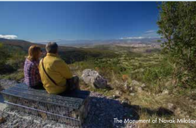
The Monument of Novak Milošev