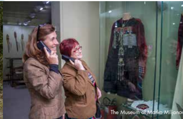
The Museum of Marko Miljanov